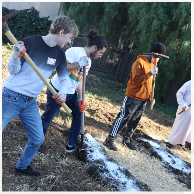
UC San Diego Youth Advisory Council Members Helping Revitalize IBNC's Garden