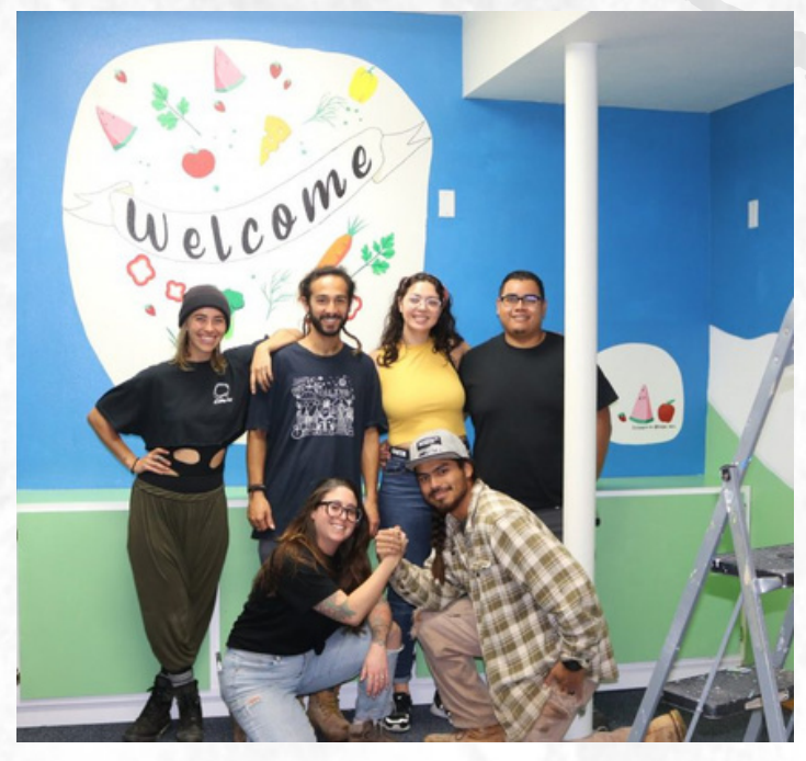
Volunteers and Local Artists

We offer these final recommendations: 1.) Seek out partnerships with mission-aligned organizations, 2.) Establish clear communications channels with all parties involved, 3.) Encourage open and frequent communication to build trust, understanding, and agreement of roles, responsibilities, and expectations from the start, 4.) Focus on making sustainable changes, 5.) Prioritize local and values-aligned community connections and input.