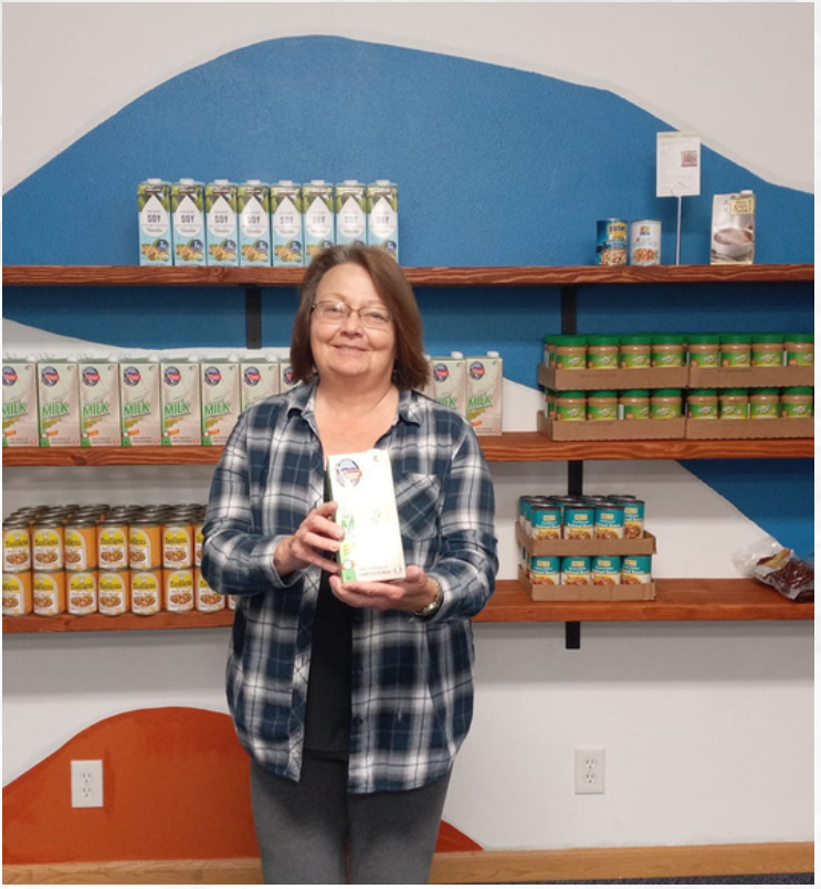
After: New Client-Choice Pantry