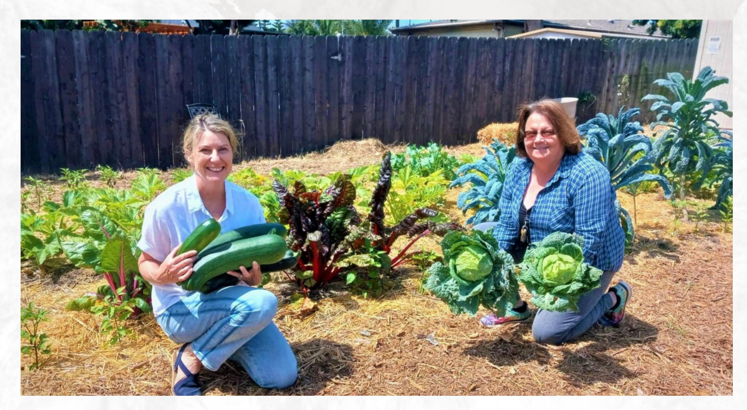
IBNC Staff Harvesting Produce Grown for Clients in New Garden Space.

San Diego Co-Harvest has harvested and distributed over 200 lbs of fresh produce for IBNC clients and other food insecure community members.